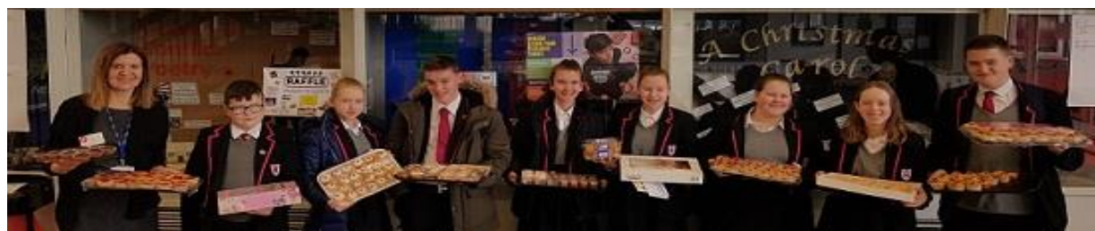
Some of the cakes from one of our charity bake sales.