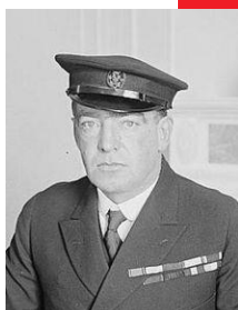
Sir Ernest Henry Shackleton CVO OBE FRGS was a polar explorer who led three British expeditions to the Antarctic, and one of the principal figures of the period known as the Heroic Age of Antarctic Exploration.