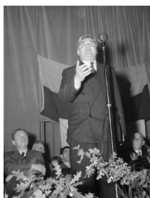
Aneurin Bevan, often known as Nye Bevan, was a Welsh Labour Party politician who was the Minister for Health in the post-war Attlee government from 1945 to 1951.

It is important that all students get an opportunity to represent their House at some point over the school year. Everything that happens within the school can feed into the House points, your academic achievements, green cards and your attendance. The only thing that won't affect the points are behaviour cards, as the negative actions of one shouldn't undermine the positive actions of others.