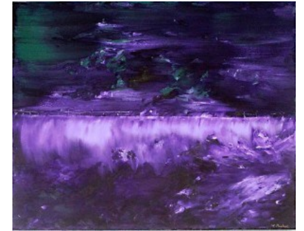
Tasha Pasha Purple Fury