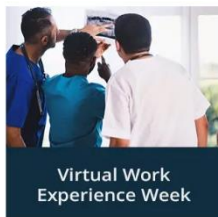
Virtual Work Experience Week