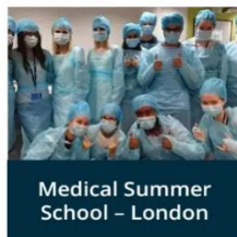
Medical Summer School - London