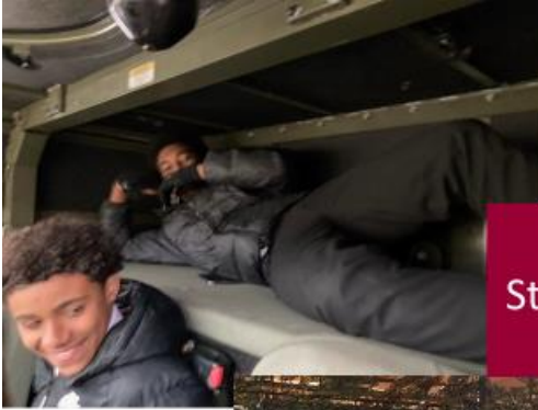
Year 10 Sport Studies trip to RAF Wittering