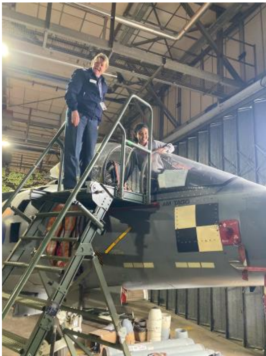
Year 10 Sport Studies trip to RAF Wittering