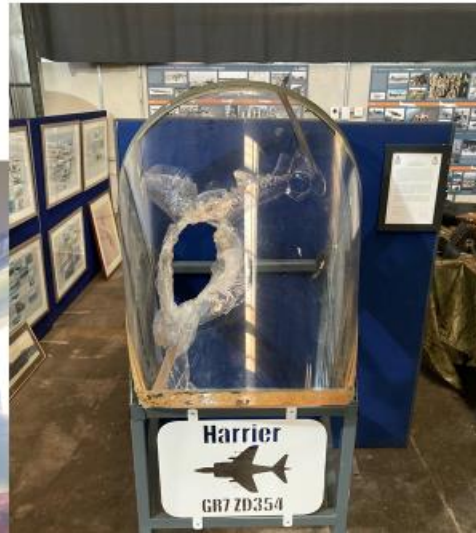
Year 10 Sport Studies trip to RAF Wittering