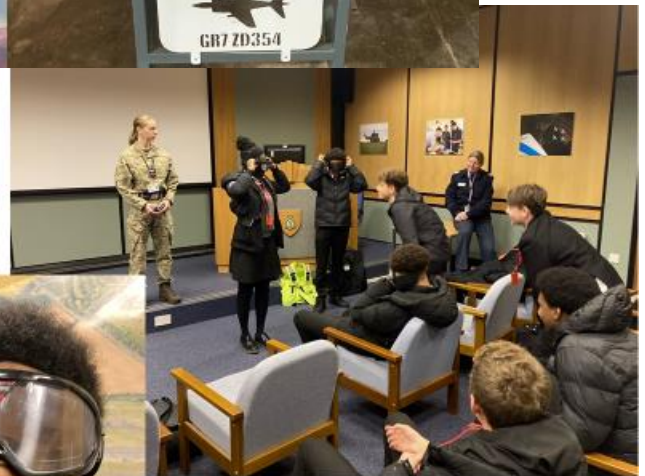
Year 10 Sport Studies trip to RAF Wittering