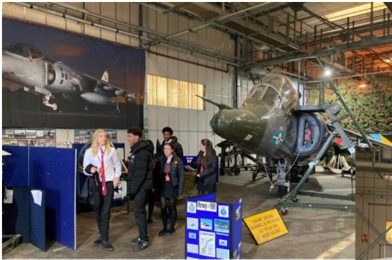
Year 10 Sport Studies trip to RAF Wittering