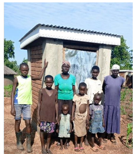
Beneficiaries are carefully selected to ensure latrines are reaching those who need them most.

In July, we were delighted to sign the contract for a second ambitious project with German Development Agency Gesellschaft für Internationale Zusammenarbeit , (GIZ). HYT has been tasked with providing household latrines for 250 refugee and host-community families in Zone 5 of Bidibidi – the largest refugee settlement in Africa. In a collaboration with GIZ in 2021, HYT installed 750 latrines for South Sudanese refugee families , also in Bidibidi. HYT's sustainable latrines will provide safe, dignified and hygienic sanitation for around 1,250 vulnerable refugees , and a further 60 refugees will benefit from cash-for-work opportunities on the project. We are immensely proud of our team in Bidibidi, despite challenges of water scarcity and very high temperatures!