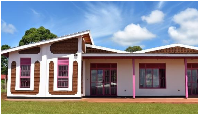
The office at non-profit Zena Launchpad, with its innovative butterfly roof.

When HYT first launched operations in Uganda in 2006, most projects were in Kamuli, near our office in Jinja. 2025, however, saw the completion of our first project in Bwindi, in the far south west of Uganda. It is encouraging to reflect on how far we have come in our 20 years of work in the ‘Pearl of Africa.’ Bwindi is home to the ancient Batwa community of former forest dwellers, who were expelled from their home in the 1990s to make way for tourism. Supported by the Kellermann Foundation and VIP Ski Chalets, and working with the Batwa Development Program (BDP), HYT built a classroom block, school latrines, six houses and toilets from 10 families in several Batwa settlements and schools, easing the transition to life outside the forest for these remarkable people.