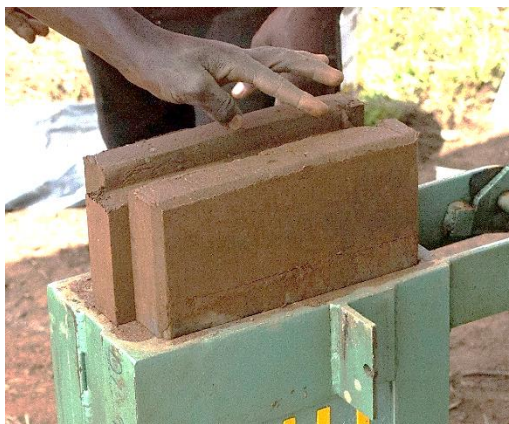
An Interlocking Stabilised Soil Block (ISSB) emerging from the compression mould, ready for sun-curing.

In 2025 HYT's forestry department successfully planted over 4,600 trees and 15 different species. Tree planting helps to absorb the high levels of carbon in our atmosphere. More locally, trees produce fruit for nearby communities, enhance biodiversity, and provide shade from the heat of the sun.